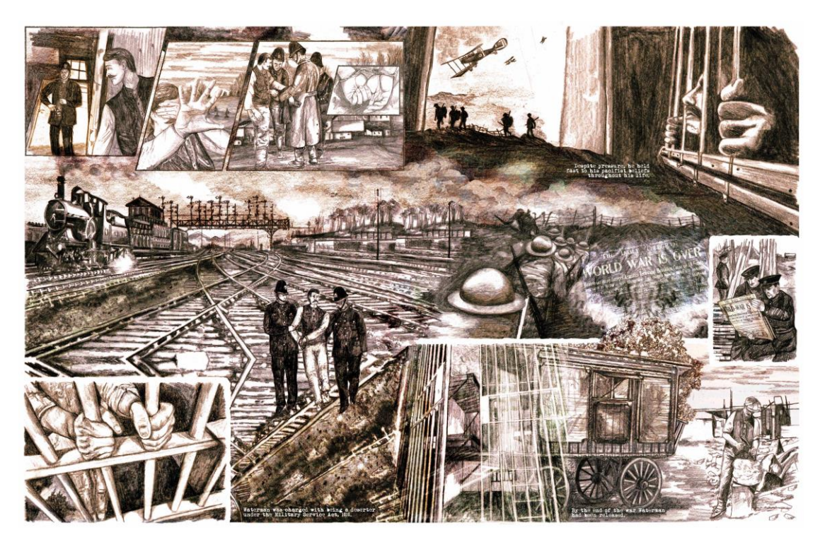
Figure 3: Copyright Kremena Dimitrova and Bishop's Stortford Museum

The washed out sepia of the graphic novels and panels convey both the utter exhaustion caused by the conflict as well as the emotionally charged and tumultuous atmosphere of the times, as can be seen in the picture below. The colour of the walls, painted grey, represents the dismal and monotonous effect of war. Likewise, the handwriting on the panels is made small and intimate in order to engage the visitor's sympathy. Finally, the room's sparse yet bright lighting is, occasionally and depending on where one stands within the exhibition space, suggestive of an interrogation lamp. In their totality, these elements shift the exhibition away from a fully coherent and chronological narrative towards a rather more disjointed atmosphere, deliberately engendering a sense of unease and negative emotional responses that reveal the horrors of the war to the museum visitor, thus bringing the police stories vividly to life (see Figures 3 and 4).