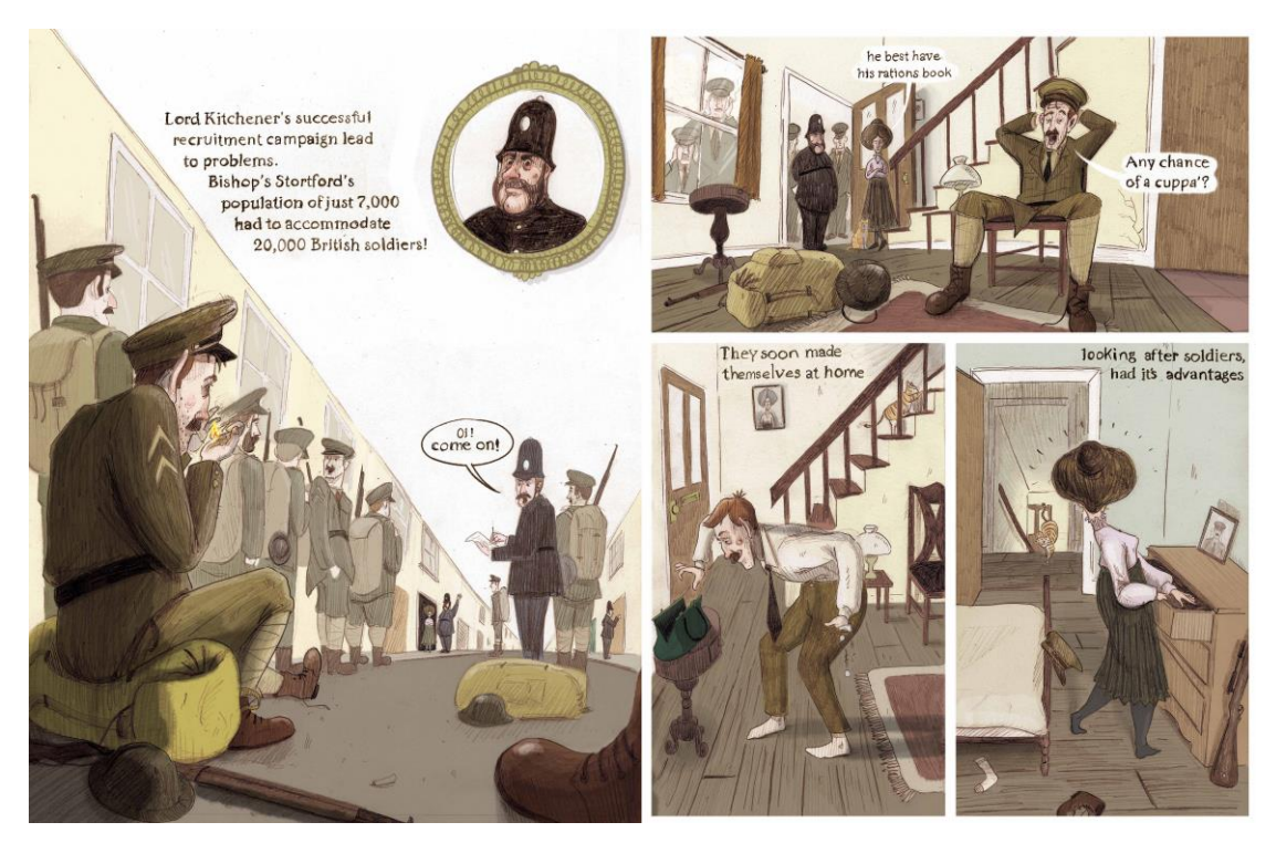
Figure 4: